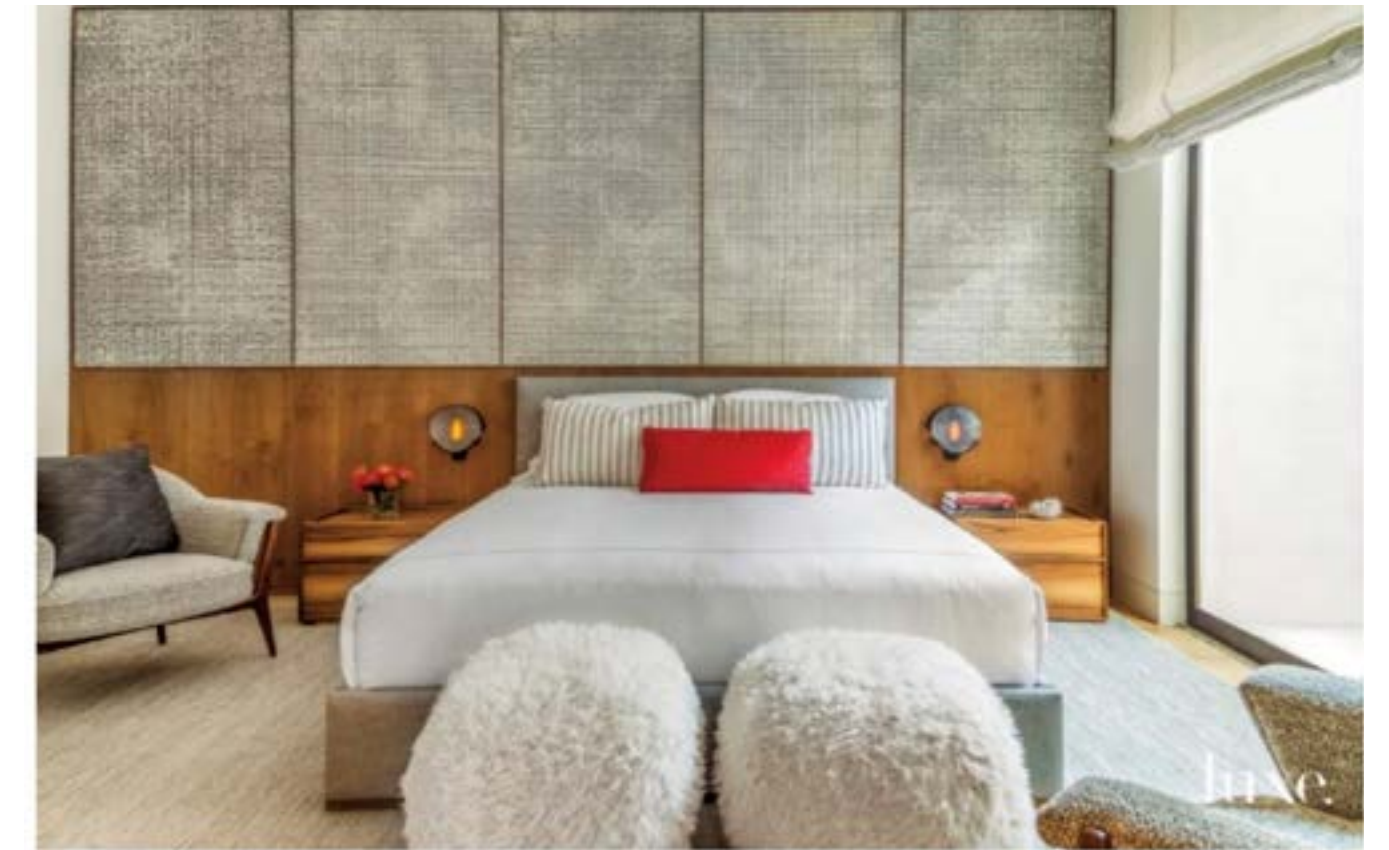
The in-law suite is designed as a retreat for the homeowners' parents. A Weitzner wallcovering is reminiscent of Japanese washi paper and makes for a dynamic backdrop. A pair of Fallon sconces by Caste Design purchased through De Sousa Hughes hang above walnut nightstands by Joel Dupras. The Coup Studio armchairs and poufs are from Coup D'Etat.