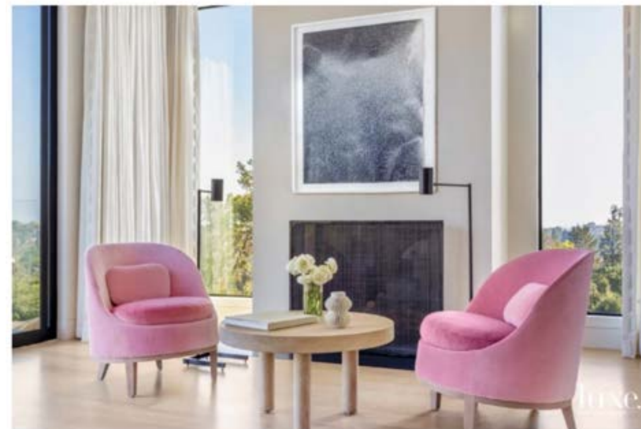
The goal was to strike a balance between using color and creating a calm environment," says Hilliard, who opted for a serene rosy pink on the Piet Boon armchairs touting Brunschwig & Fils velvet in the sitting area of the master suite. The seat back and lumbar pillows are covered in a Pierre Frey fabric from Kneidler-Fauchel.