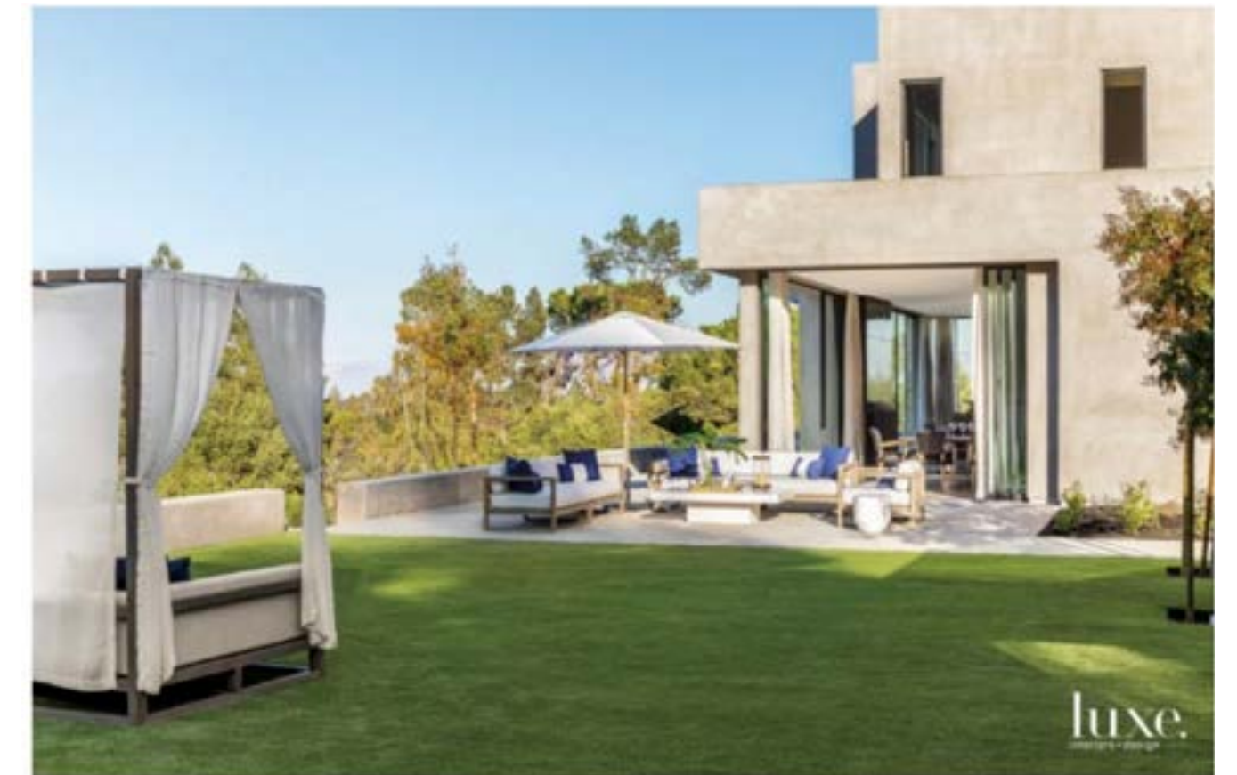
Entertaining often extends to the outside seating area located off the great room, where the doors by Euroline Steel Windows & Doors slide open to establish an easy indoor-outdoor flow. The teak sofas and side chair surround an ivory stone and concrete coffee table, all from RH.