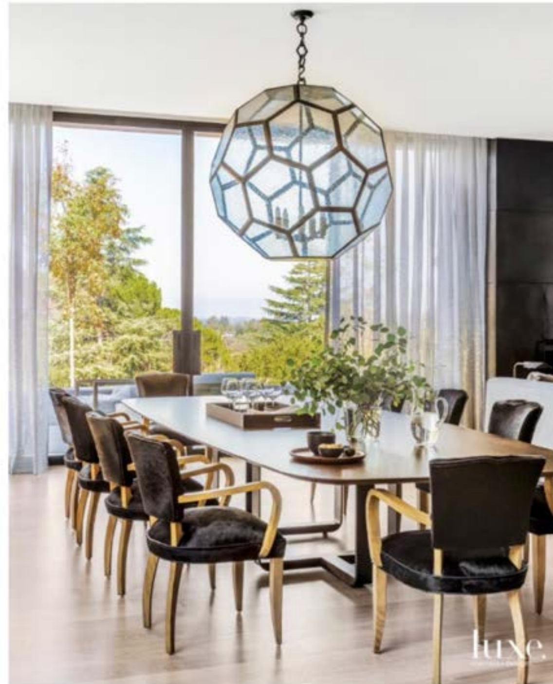
A designer outfits a modern Los Altos Hills home to reflect the lifestyle and heritage of its occupants.