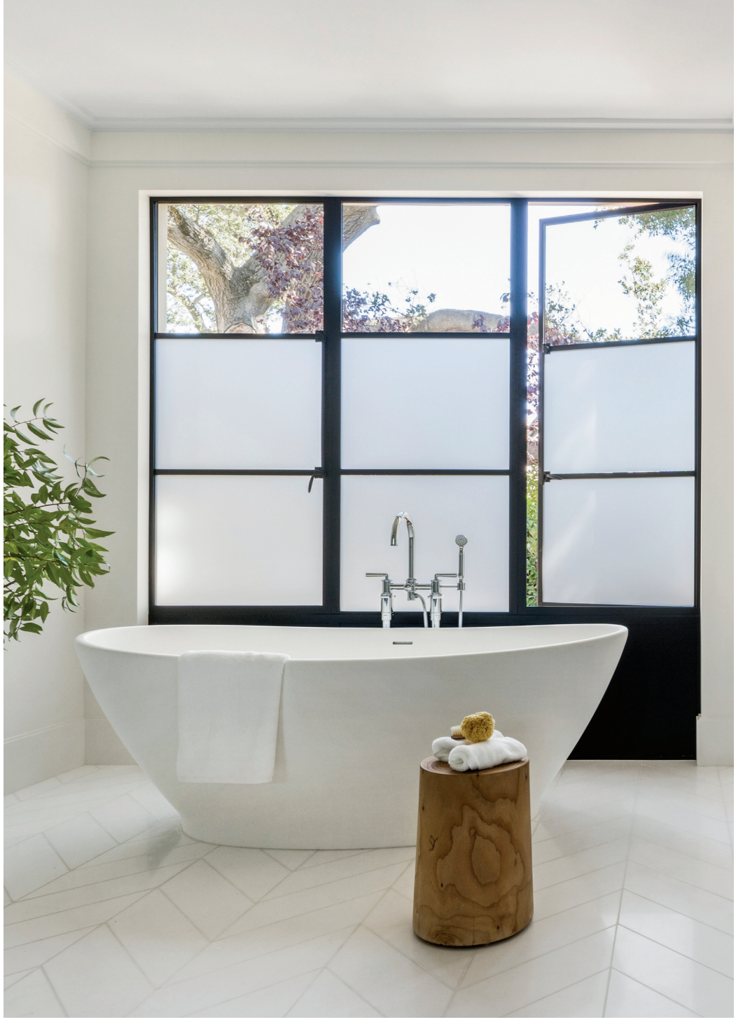
Above: Frosted windowpanes provide privacy while still allowing plenty of natural light to filter into the main bathroom, emphasizing its airy palette. The tub is by MTI, and a salvaged-cedar table by Riva 1920 from Nido Living adds an organic accent.

Left: The main bedroom's neutral palette blends the cool gray tones of a paneled wall and upholstered Brian Paquette for Lawson-Fenning bench with the soft beiges of bespoke bedside tables in bleached white oak and a bed upholstered in a woven Coraggio fabric. The oil-rubbed bronze-and-linen pendant was made by Phoenix Day.