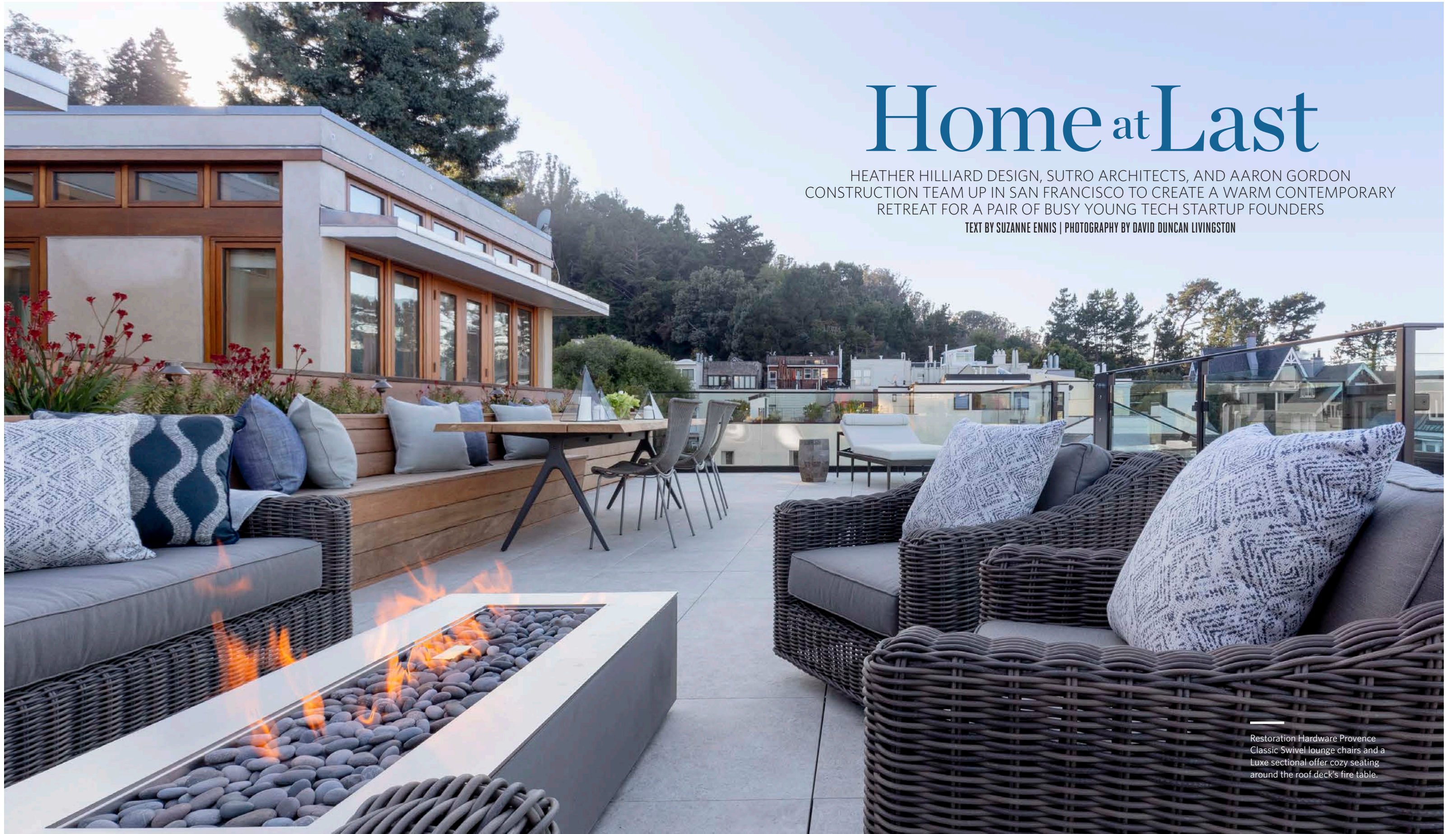
Restoration Hardware Provence Classic Swivel lounge chairs and a Luxe sectional offer cozy seating around the roof deck's fire table.

TEXT BY SUZANNE ENNIS | PHOTOGRAPHY BY DAVID DUNCAN LIVINGSTON