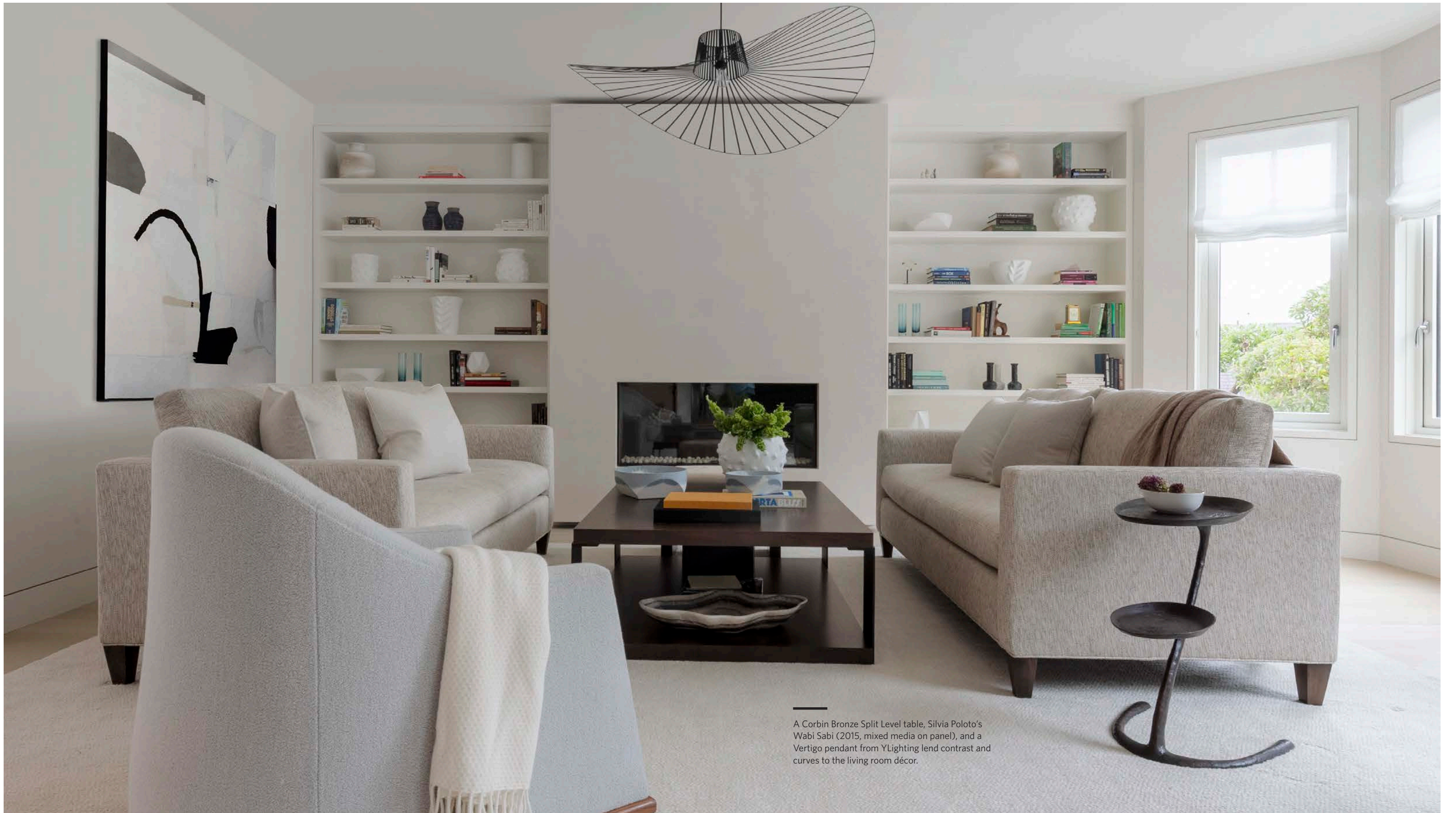
A Corbin Bronze Split Level table, Silvia Poloto's Wabi Sabi (2015, mixed media on panel), and a Vertigo pendant from YLighting lend contrast and curves to the living room décor.